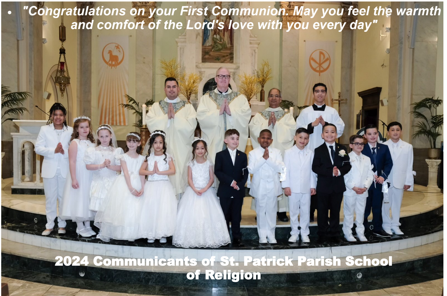
2024 Communicants of St. Patrick Parish School of Religion